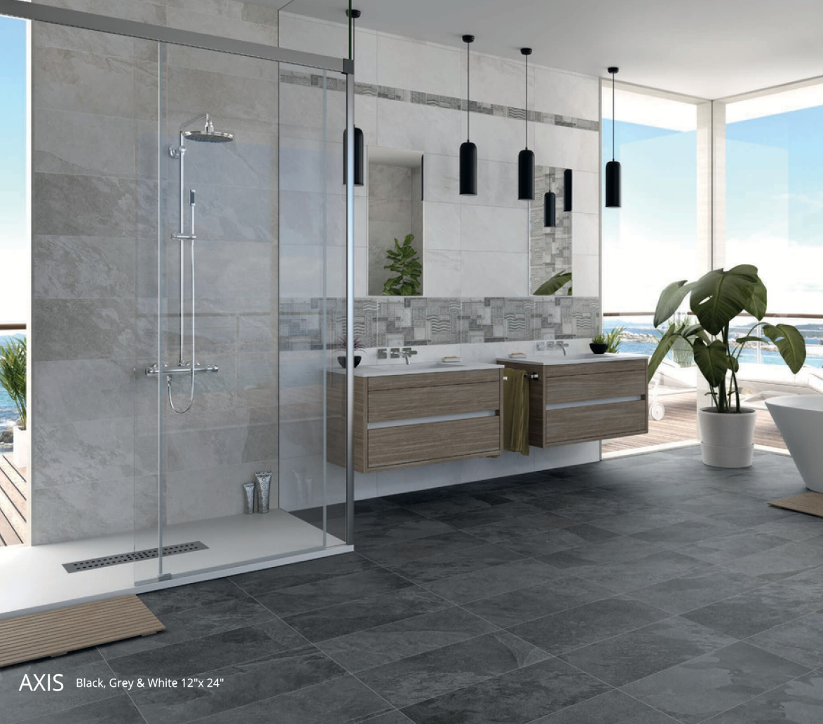
AXIS Black, Grey & White 12"x 24"