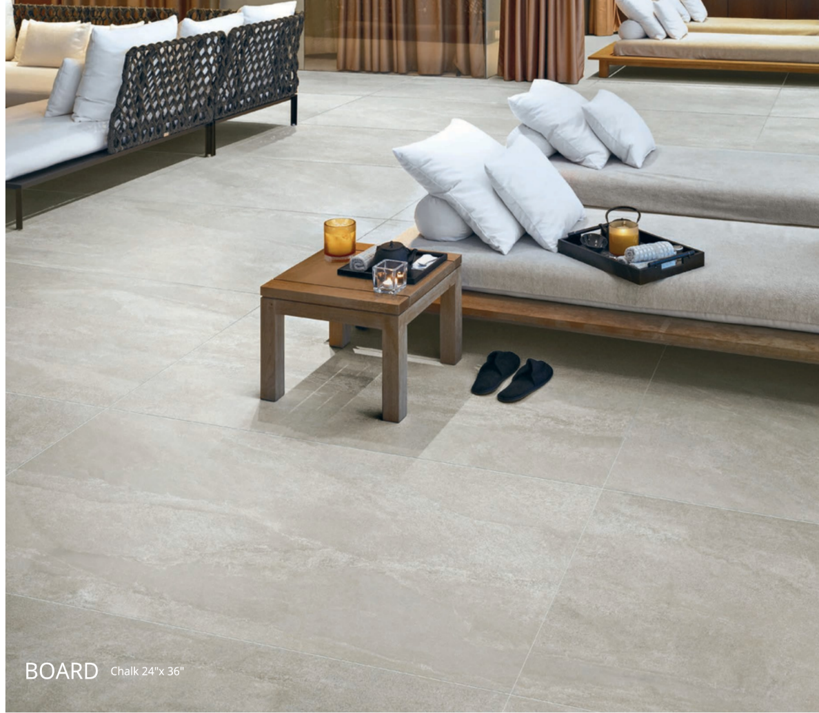
BOARD Chalk 24"x 36"

The BOARD Collection flawlessly demonstrates the feeling and texture of slate in a porcelain tile. This collection turns a common place material into one of luxury. Great for interior and exterior applications . Can be used for floors, walls, counter-tops and many other surfaces . Impervious porcelain is resistant to stains, scratches, chemicals, extreme temperatures and UV exposure.