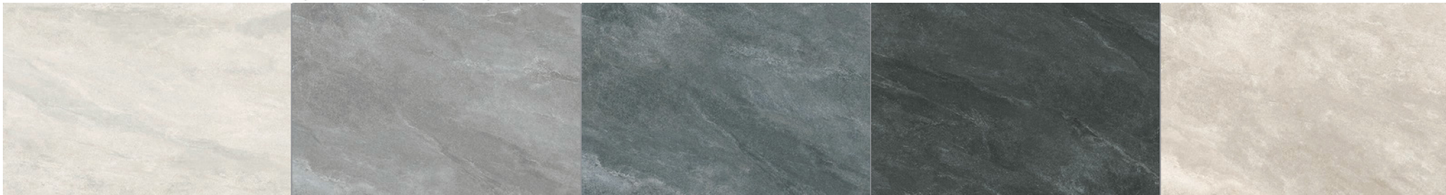
Chalk 24"x 36"