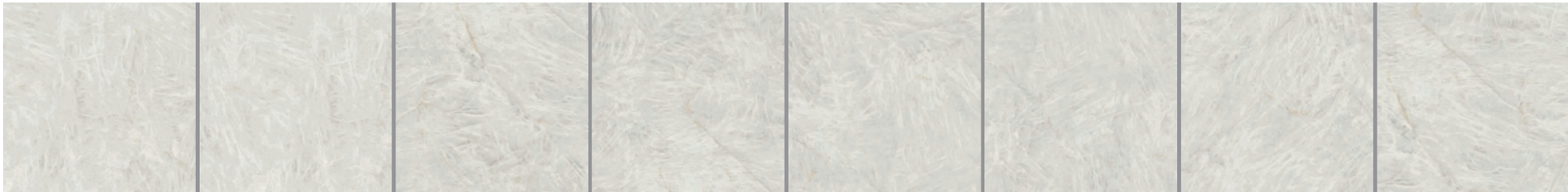
Crystal White 48"x 48" Porcelain Tile