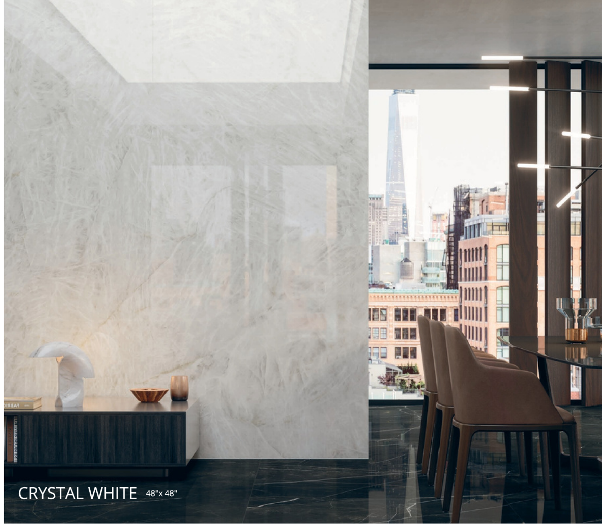
CRYSTAL WHITE 48"x 48"

The CRYSTAL WHITE Collection is inspired by luxurious quartzite stone , with crisscrossed veining that bears the essence of winter. Great for interior and exterior living spaces . Can be used for floors, walls, counter-tops and many other surfaces . Impervious porcelain is resistant to stains, scratches, chemicals, extreme temperatures and UV exposure.