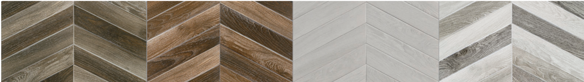
Dark 3.15"x 16"