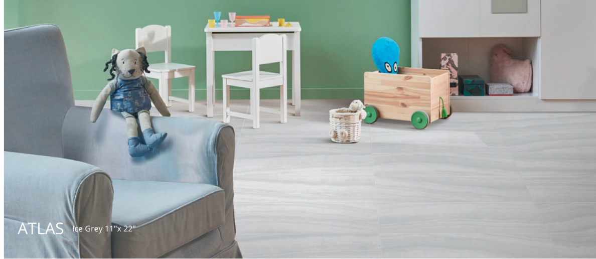
ATLAS Ice Grey 11"x 22"