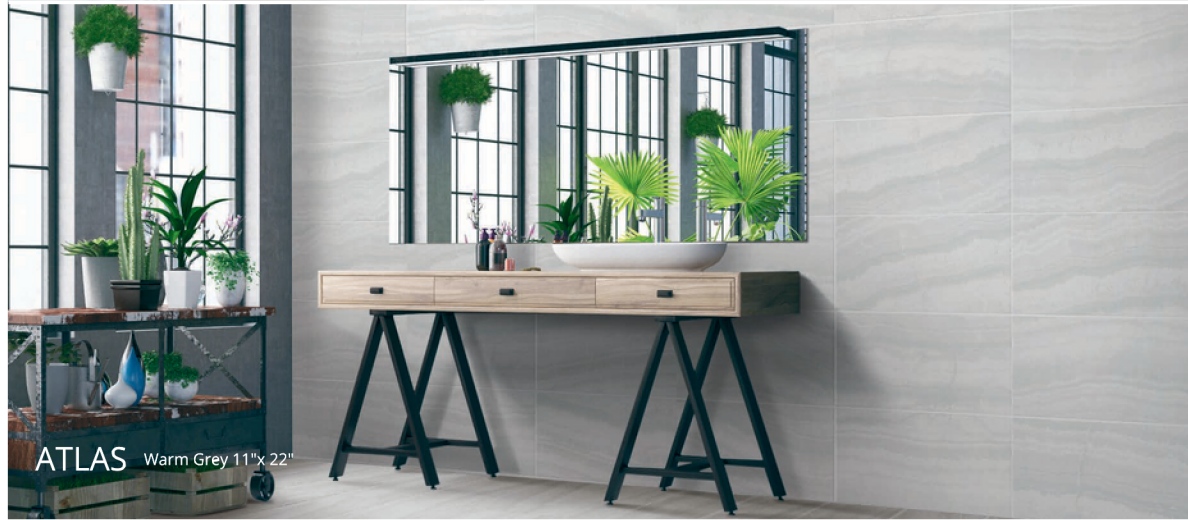
ATLAS Warm Grey 11"x 22"

The ATLAS Collection carries the essence of prime vein cut tile depicted in every piece, making it an excellent choice for contemporary and traditional spaces. Great for interior and exterior applications . Can be used for floors, walls, counter-tops and many other surfaces . Impervious porcelain is resistant to stains, scratches, chemicals, extreme temperatures and UV exposure.