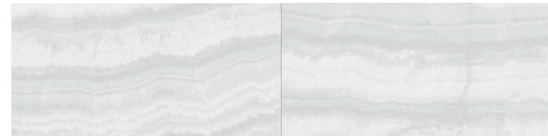
Warm Grey 11"x 22"