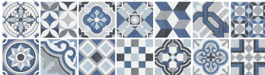
Patch Pattern 9.25"x 9.25"