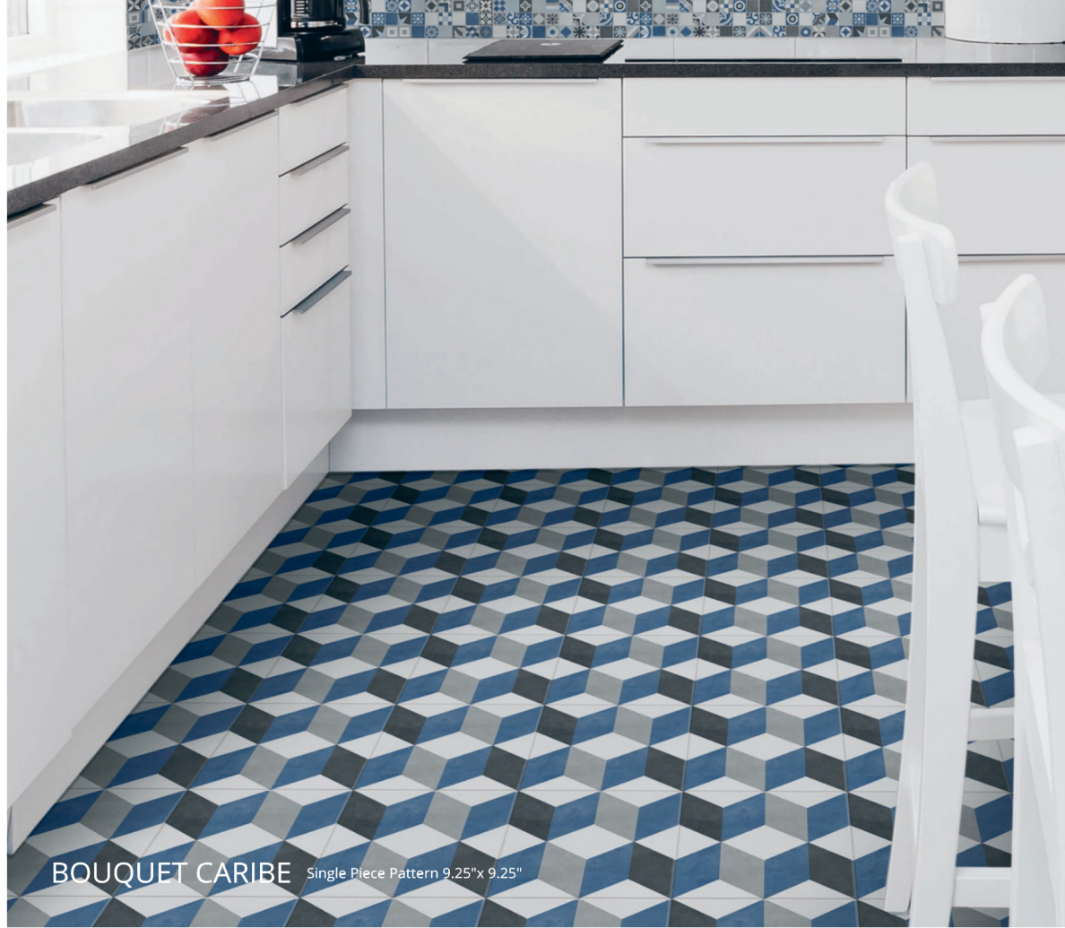
BOUQUET CARIBE Single Piece Pattern 9.25"x 9.25"

Patterns take precedence with the BOUQUET Collection which embraces an old architectural feature to enhance contemporary spaces . This collection combines artistic blues, neutral tones and grays and is available in a 9¼"x 9¼" tile and matching 2"x 2" mosaics on mesh. Great for interior and exterior living spaces . Porcelain tiles can be used for floors, walls, counter-tops and many other surfaces . Impervious porcelain is resistant to stains, scratches, chemicals, extreme temperatures and UV exposure.