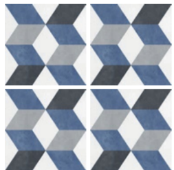
Single Piece Pattern 9.25"x 9.25"