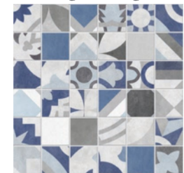
Mosaic Pattern 2"x 2" on 12"x12" Mosaic Mesh