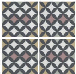
Single Piece Pattern 9.25"x 9.25"