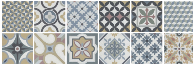
Patch Pattern 9.25"x 9.25"