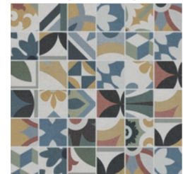
Mosaic Pattern 2"x 2" on 12"x12" Mosaic Mesh