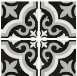
Single Piece Pattern 9.25" x 9.25"