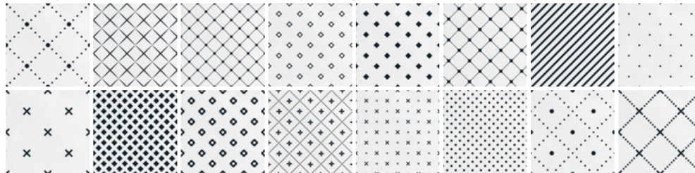
Patch Pattern 9.25" x 9.25"