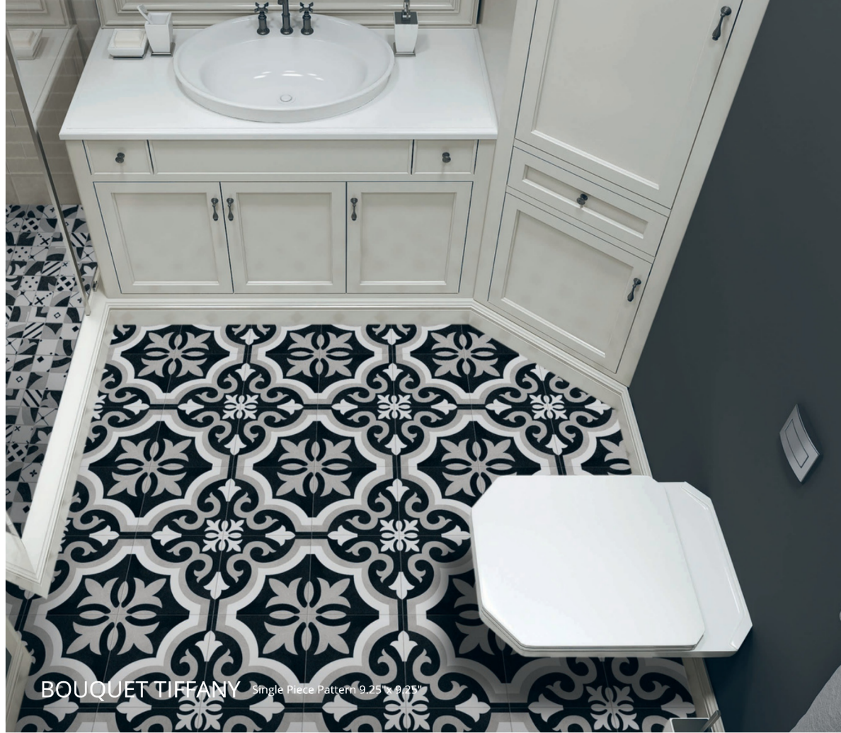
BOUQUET TIFFANY Single Piece Pattern 9.25" x 9.25"

This black and white patterned porcelain tile embraces old architectural features to enhance contemporary spaces . This porcelain collection offers eye catching designs in a classic black and white look and is available in 9 1/4" x 9 1/4" tile and matching 2" x 2" mosaics on mesh. Great for interior and exterior living spaces . Porcelain tiles can be used for floors, walls, counter-tops and many other surfaces . Impervious porcelain is resistant to stains, scratches, chemicals, extreme temperatures and UV exposure.