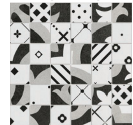
Mosaic Pattern 2" x 2" on 12" x 12" Mosaic Mesh