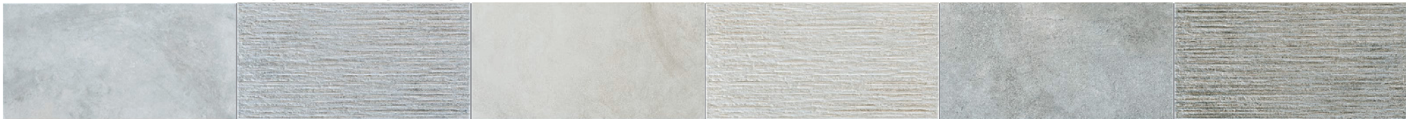
Ash 24"x 48"