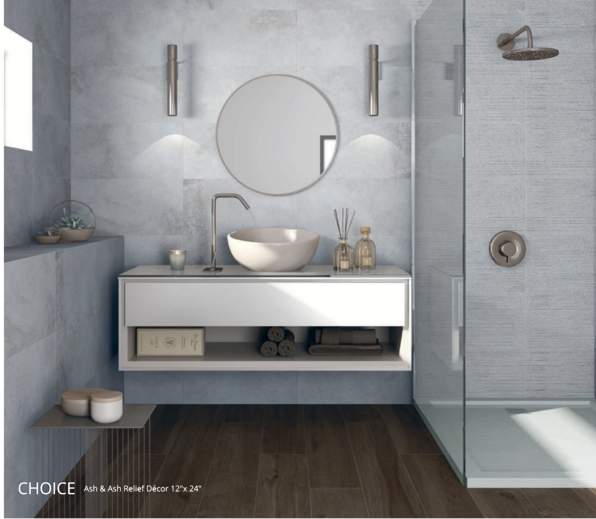
CHOICE Ash & Ash Relief Décor 12"x 24"

The CHOICE Collection offers a clean modern look in three eye catching colors . Each color has a matching "combed" finish decorative tile giving your project depth in design and a complementary sophisticated look. Great for interior and exterior living spaces . Porcelain tiles can be used for floors, walls, counter-tops and many other surfaces . Impervious porcelain is resistant to stains, scratches, chemicals, extreme temperatures and UV exposure.