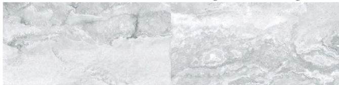
Grey 12"x 24"