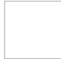
18" x 18"