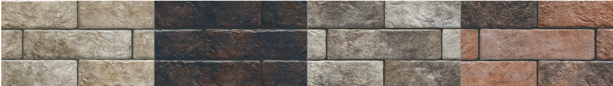
Ladrillo Avila 3"x 11"