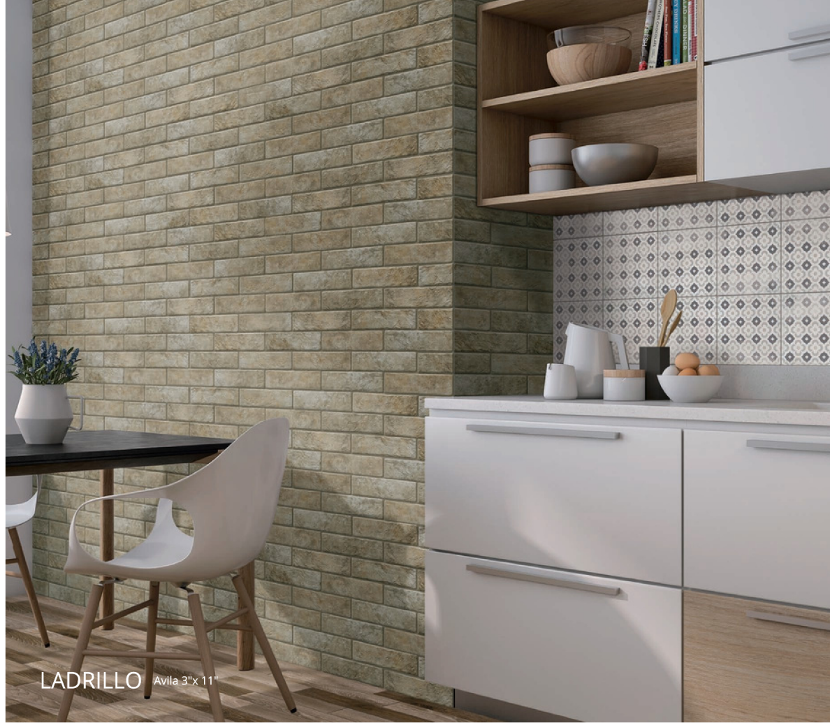
LADRILLO Avila 3"x 11"

The LADRILLO and MURALLA Collections give a modern industrial feel , ideal for individuals looking to warm their home with intricate details that function as bricks that are typically seen in New York loft homes . Great for interior and exterior applications . Can be used for floors, walls, counter-tops and many other surfaces . Impervious porcelain is resistant to stains, scratches, chemicals, extreme temperatures and UV exposure.