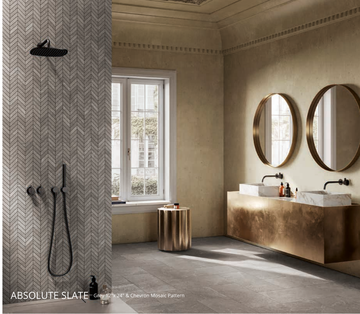
ABSOLUTE SLATE - Grey 12"x 24" & Chevron Mosaic Pattern

The ABSOLUTE SLATE Collection is an exquisite assortment of three neutral , but graphically varied shades . The rocky veining of this series forms tasteful compositions for floors, walls, counter-tops and many other surfaces . Great for interior and exterior applications . Impervious porcelain is resistant to stains, scratches, chemicals, extreme temperatures and UV exposure.