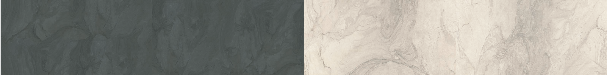
Atlantis Anthracite Matte Finish 48"x 96"x 3/8" (9MM)