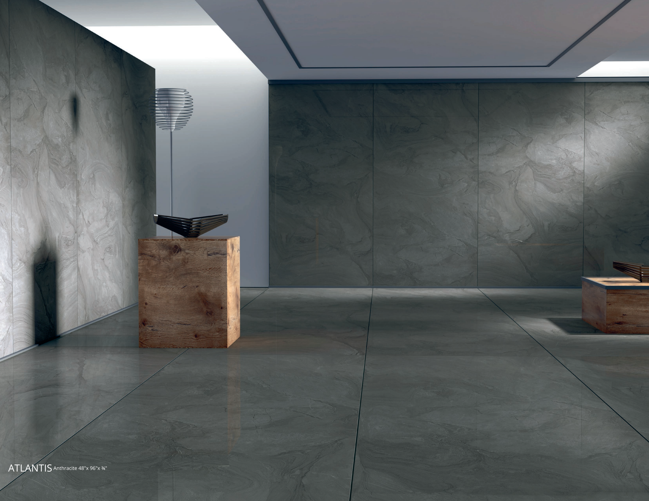
ATLANTIS Anthracite 48"x 96"x 3/8"