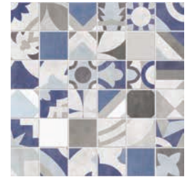
Mosaic Pattern 2" x 2" on 12" x 12" Mosaic Mesh