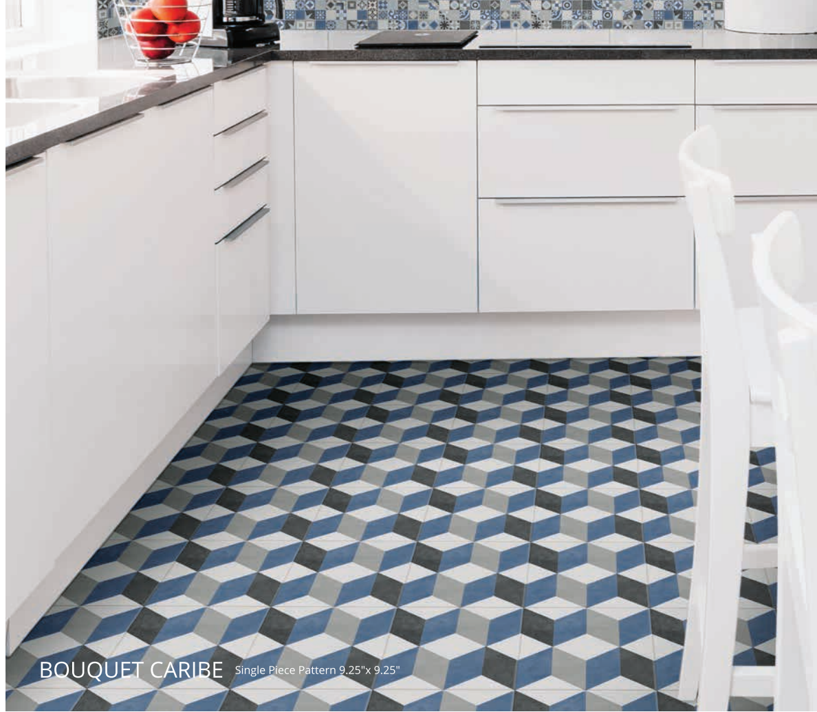
BOUQUET CARIBE Single Piece Pattern 9.25" x 9.25"

Patterns take precedence with the BOUQUET Collection which embraces an old architectural feature to enhance contemporary spaces . This collection combines artistic blues, neutral tones and grays and is available in a 9¼" x 9¼" tile and matching 2" x 2" mosaics on mesh. Great for interior and exterior living spaces . Porcelain tiles can be used for floors, walls, counter-tops and many other surfaces . Impervious porcelain is resistant to stains, scratches, chemicals, extreme temperatures and UV exposure.