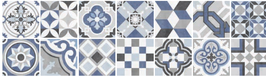
Patch Pattern 9.25" x 9.25"