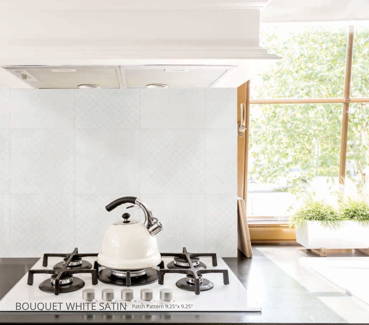
BOUQUET WHITE SATIN Patch Pattern 9.25"x 9.25"

The BOUQUET WHITE SATIN Collection offers a simple yet sophisticated look with very subtle pattern details on the tiles which gives the collection more character when viewed at different angles of the light. Great for interior and exterior living spaces . Porcelain tiles can be used for floors, walls, counter-tops and many other surfaces . Impervious porcelain is resistant to stains, scratches, chemicals, extreme temperatures and UV exposure.