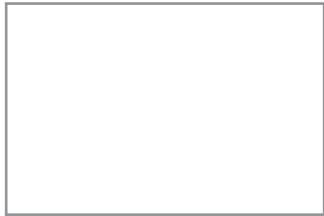
24"x 36"x 3/4" (2CM)