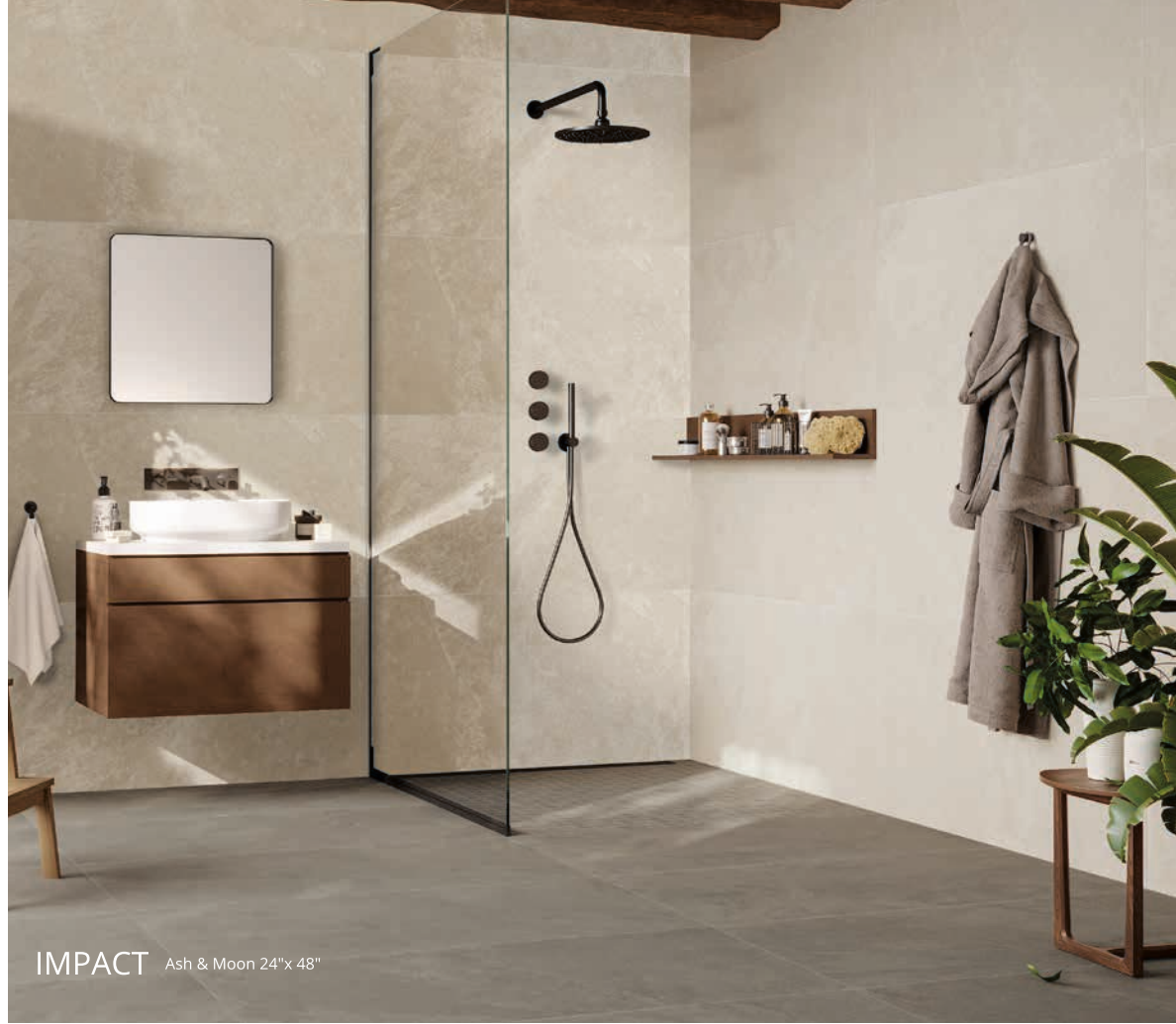
IMPACT Ash & Moon 24"x 48"

The IMPACT Collection is a quintessential embodiment of slate stone , expressing the dynamic graphics in each piece. Its versatile elegance is well suited for modern and traditional living spaces . Available in tile , mosaic tile and paver format. Impervious porcelain is resistant to stains, scratches, chemicals, extreme temperatures and UV exposure.