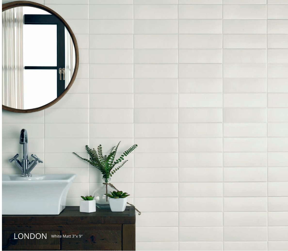
LONDON White Matt 3"x 9"

The LONDON Collection is a quintessential subway tile that is available in an array of earth tone colors, in a 3"x9" size and matching demi-bullnose. The glossy finish makes this material versatile and easy to clean. These tiles are suitable for backsplash, interior walls, shower, and tub surround living spaces and are recommended by the manufacturer for use in wet areas inside the home.