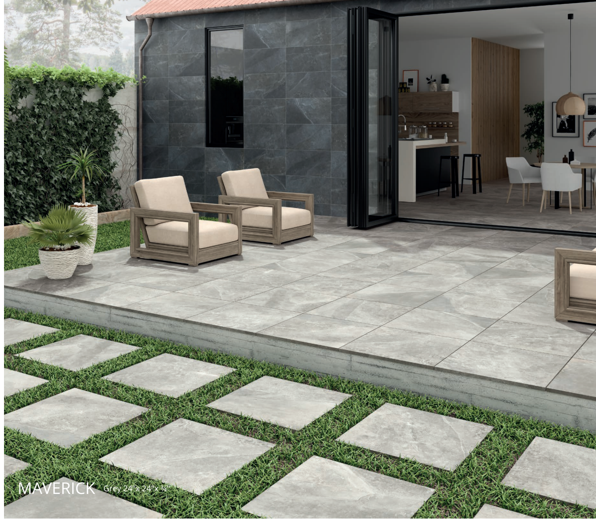
MAVERICK Grey 24"x 24"x 3/4"

The MAVERICK Collection is a remarkable paver series, with two colors which contain a cloudy texture with random, subtle veining throughout each piece. Great for exterior and interior applications . Impervious porcelain is resistant to stains, scratches, chemicals, extreme temperatures and UV exposure.