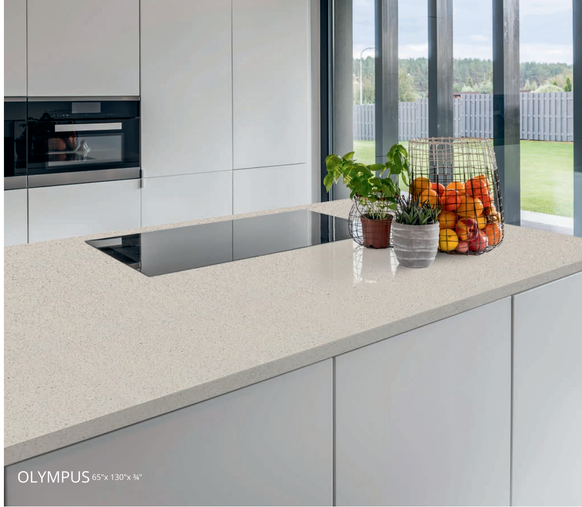
OLYMPUS 65" x 130" x ¾"

Inspired by the home of the titans , the OLYMPUS quartz slab is a majestic surface application, comprised of a sand-like texture with the durability of the divine. Designed for both commercial and residential settings . Can be used for floors, walls, counter-tops and many other surfaces . Manufactured quartz slabs are highly durable materials , which are resistant to chemical stains and scratches . The non-porous surface of quartz slabs allows for easy cleaning and minimal maintenance .