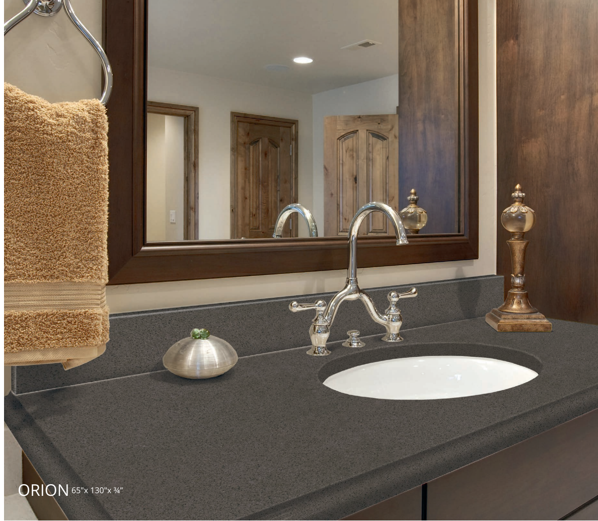
ORION 65"x 130"x ¾"

Named after the famous constellation, the ORION quartz slab is composed of an enticing shade of dark granules , resembling the vastness of the night sky. Designed for both commercial and residential settings . Can be used for floors, walls, counter-tops and many other surfaces . Manufactured quartz slabs are highly durable materials , which are resistant to chemical stains and scratches . The non-porous surface of quartz slabs allows for easy cleaning and minimal maintenance .