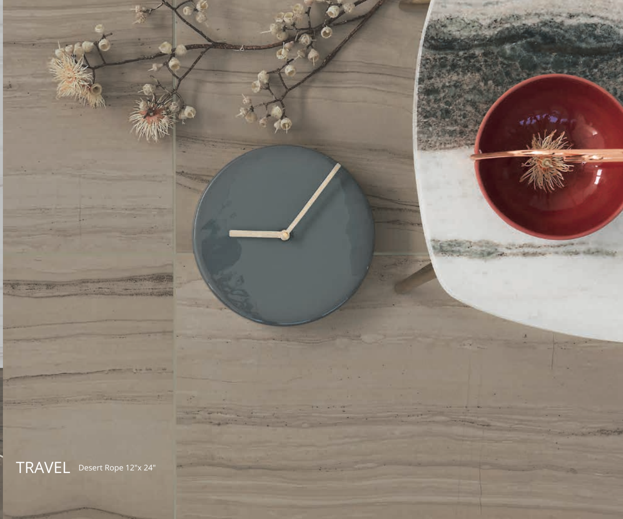
TRAVEL Desert Rope 12"x 24"