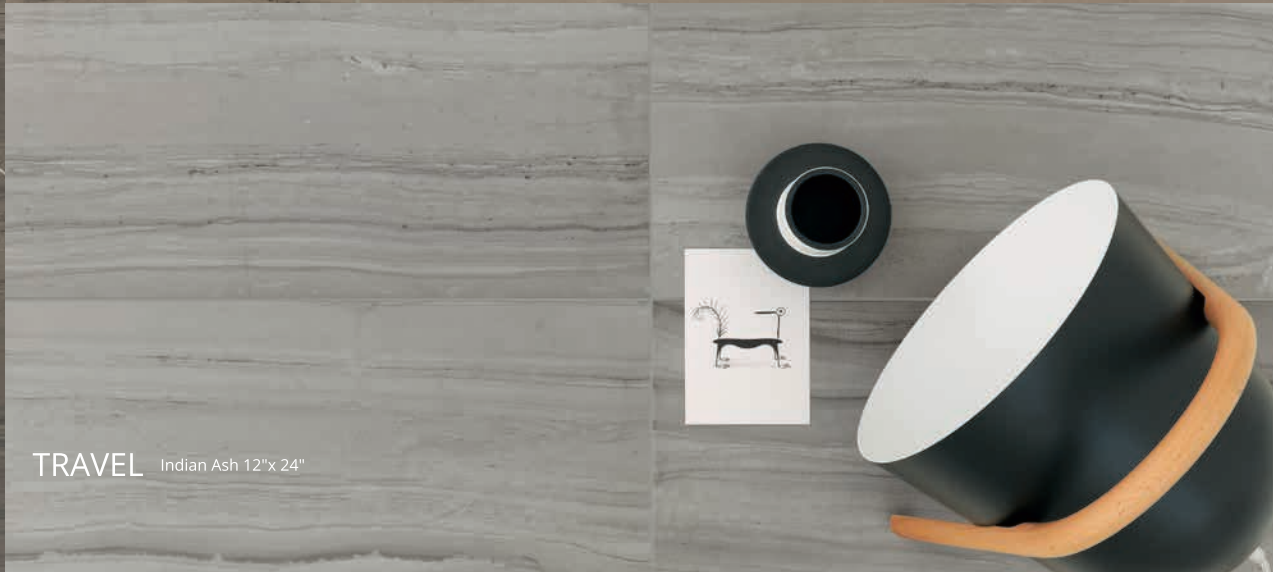
TRAVEL Indian Ash 12"x 24"