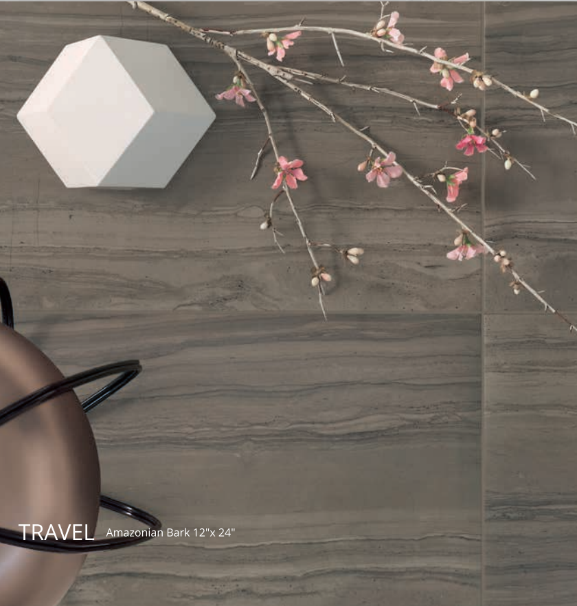
TRAVEL Amazonian Bark 12"x 24"