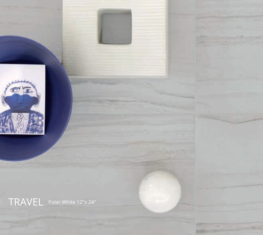
TRAVEL Polar White 12"x 24"