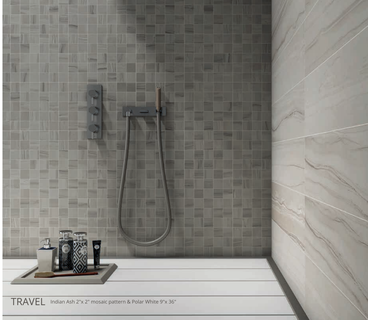
TRAVEL Indian Ash 2"x 2" mosaic pattern & Polar White 9"x 36"

The TRAVEL Collection offers four different colors in a beautiful vein cut limestone look . These selections offer an upscale look and would complement any décor. Great for interior and exterior applications . Can be used for floors, walls, counter-tops and many other surfaces . Impervious porcelain is resistant to stains, scratches, chemicals, extreme temperatures and UV exposure.