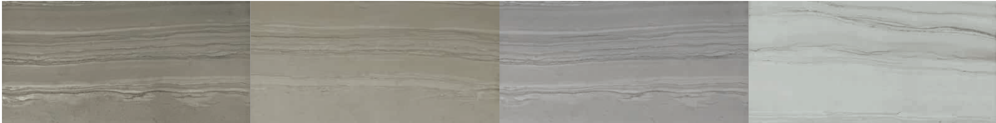
Amazonian Bark 12"x 24"