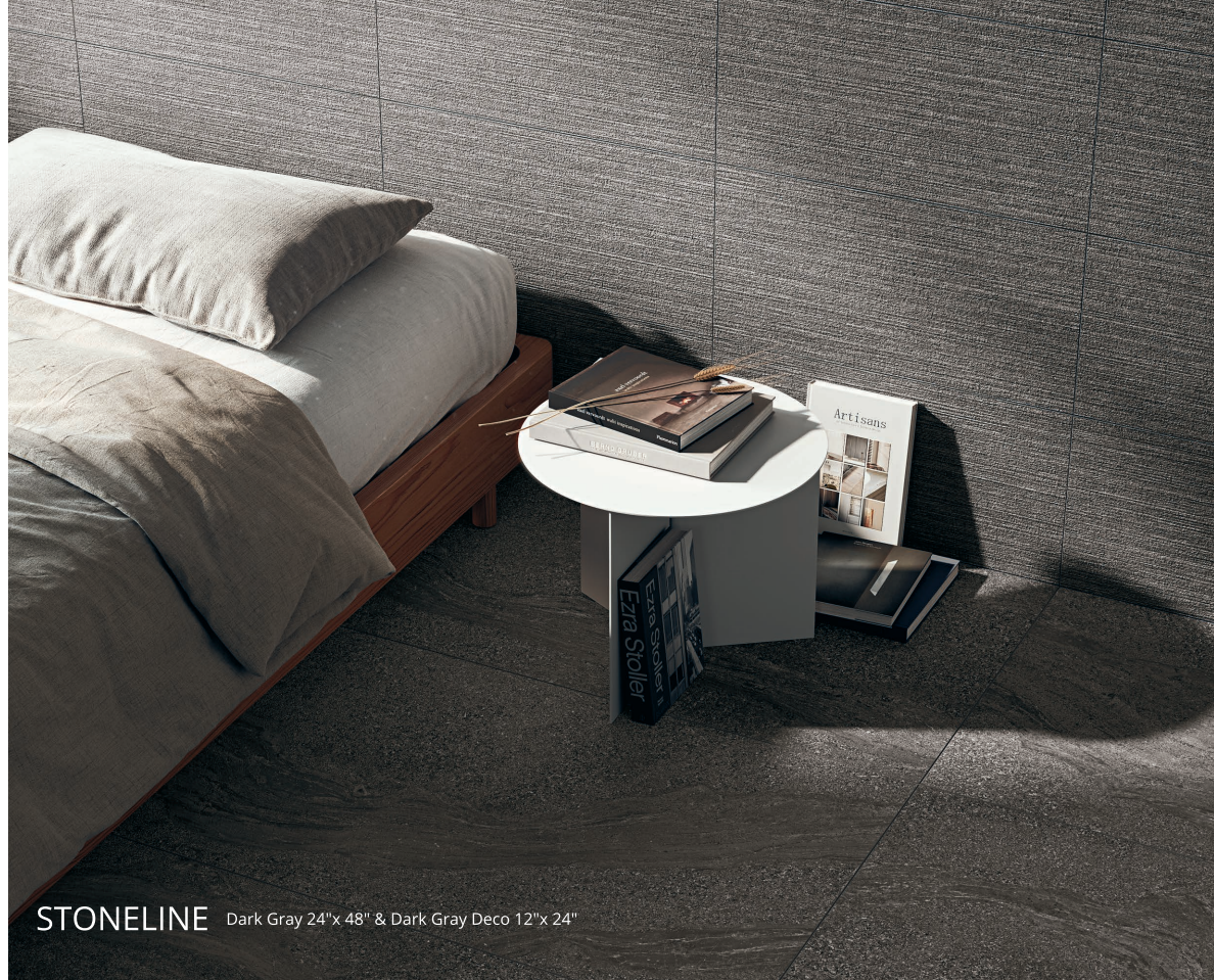
STONELINE Dark Gray 24"x 48" & Dark Gray Deco 12"x 24"

Influenced by the look of sedimentary rock , the STONELINE Collection is a striking display of elegant textures and unusual variegated effects , yielding forth a bold and sophisticated style that is sure to enhance any traditional or contemporary environment . Available in 12"x 24" , 12"x24" Deco and 24"x 48" tile formats. Great for interior and exterior applications . Can be used for floors, walls, counter-tops and many other surfaces . Impervious porcelain is resistant to stains, scratches, chemicals, extreme temperatures and UV exposure.