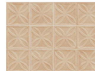
Biscotto Struttura 3D