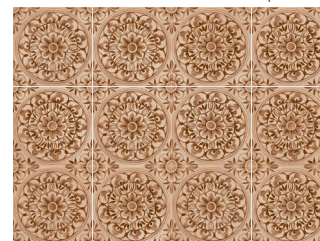
Biscotto Decoro Pizzo 8"x 8"