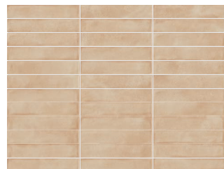
Biscotto 2"x 12"