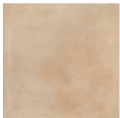
Biscotto 24"x 24"

GRAPHIC DEVELOPMENT - 16 High Definition Digital Images: Biscotto 24"x24" | 32 High Definition Digital Images: Biscotto 8"x8" 1 High Definition Digital Image: Biscotto Decoro Pizzo, Decoro Zucchero & Struttura 3D 8"x8" | 1 High Definition Digital Image: Biscotto 2"x12"